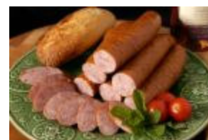
Kielbasa (polish sausage)

In South Bend, the year's political campaign season usually starts on this day (particularly among Democrats). The politicians visit various sites around South Bend. Also on this day, people usually eat kielbasa, a traditional Polish sausage and kapusta a traditional sweet and sour cabbage. The Polish sausage can be purchased in local supermarkets.